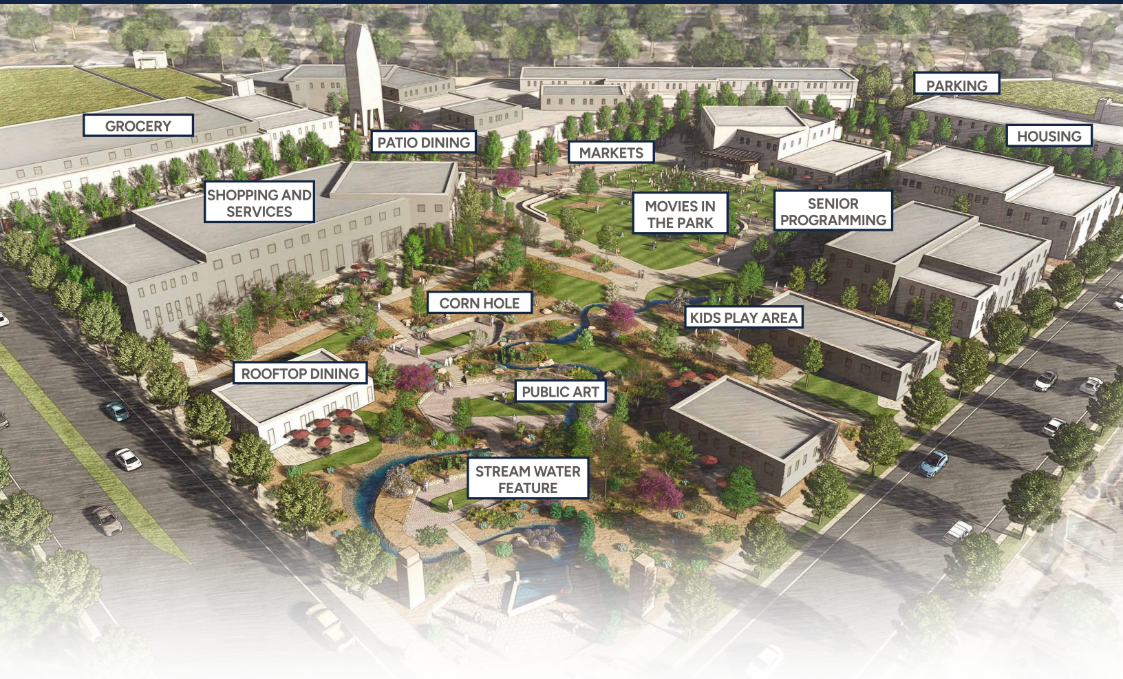
Concept A Rendering