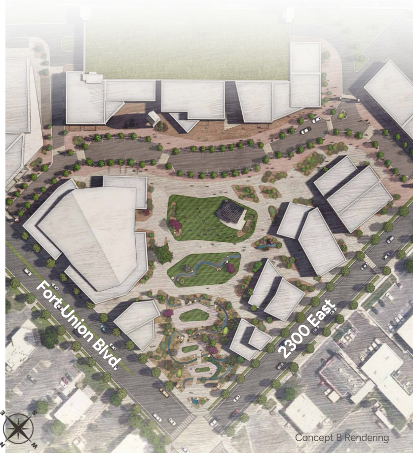
Concept B Rendering