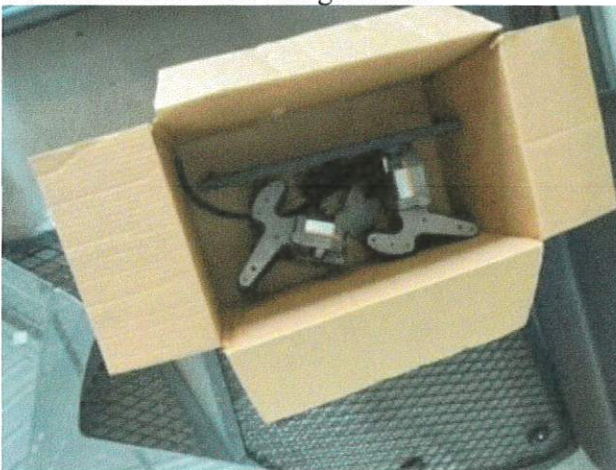
4 Handcuff gunlocks